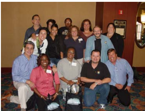
11th Circuit Team