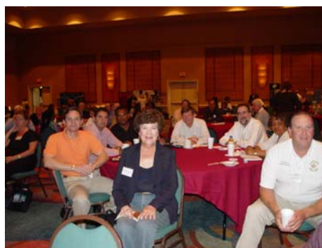
17th Circuit Team